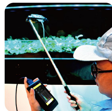
Sensor head can be used with a selfie stick and camera tripod. Users can easily measure far reaching ranges and adjust the measurement point horizontally.